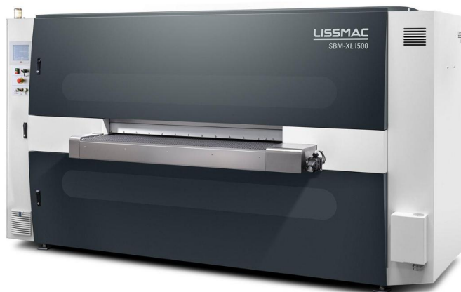
Image 3 - SBM - XL G2S2 - LISSMAC.webp