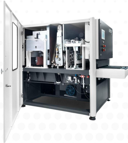
Image 5 - SMD - 133 DRE - LISSMAC.webp