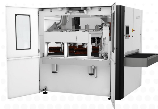
Image 3 - SMD 3 - ÉDITION S - LISSMAC.webp