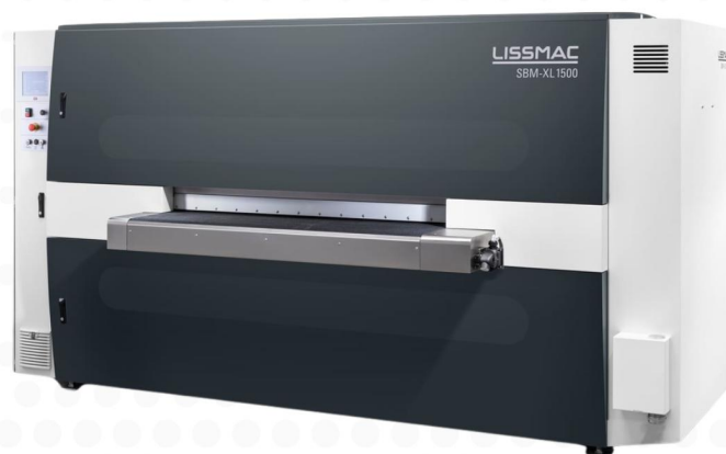
Image 3 - SBM - XL S2B2 - LISSMAC.webp